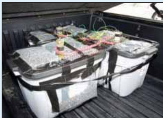
Vehicle-borne improvised explosive device