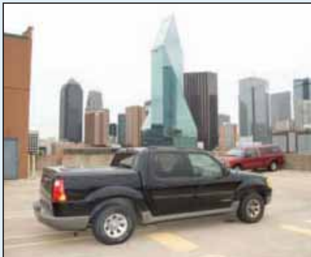
Vehicle that housed the vehicle-borne improvised explosive device with the target location in the background

In May 2010, Smadi pleaded guilty to one count of attempting to use a weapon of mass destruction and was sentenced to 24 years in prison in October 2010. As is typical in UCOs that result in overwhelming evidence against a defendant, Smadi's defense attorneys argued entrapment and mental health issues early in the prosecution. After discovery was completed, the defense team conceded there was no plausible way for an entrapment defense. The complete rejection of entrapment was a result of the issue being identified early on in the investigation and addressed throughout the case. In virtually every undercover conversation with