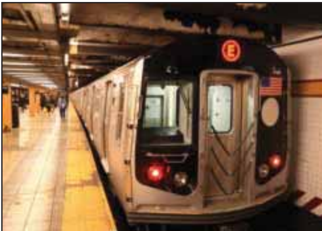
New York City subway system

In the early 2000s, a number of al Qaeda affiliates and regional terrorist groups emerged, and, although they took on the name of al Qaeda and adopted its ideology, they largely adhered to a local agenda, focusing on regional issues and attacking local targets. At the time of the 2007 National Intelligence Estimate publication, al Qaeda in Iraq (AQI) was the only al Qaeda affiliate known to have expressed a desire to strike the homeland. Within Iraq, AQI inflicted thousands of casualties on coalition forces and Iraqi civilians. Beyond the country's borders, AQI fanned the flames of the global jihadist movement and claimed credit for the June 2007 failed vehicle-borne improvised explosive device