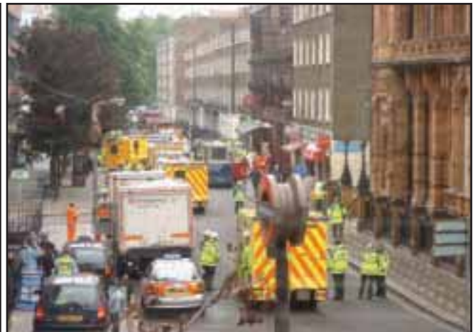
Russell Square, London