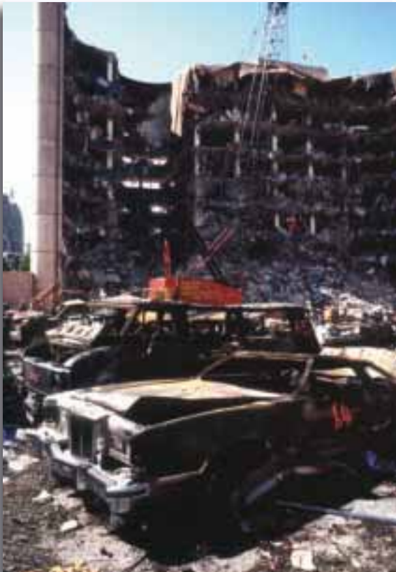
Alfred P. Murrah Federal Building, Oklahoma City

money from the strawman.” In essence, it is extorting money from the U.S. Treasury Department. Sovereign citizens file legitimate IRS and Uniform Commercial Code forms for illegitimate purposes, believing that doing so correctly will compel the U.S. Treasury to fulfill its debts, such as credit card debts, taxes, and mortgages. 3