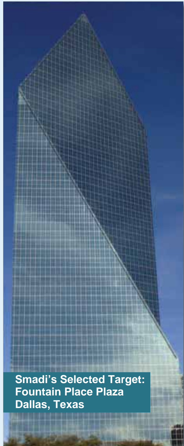
Smadi's Selected Target: Fountain Place Plaza Dallas, Texas

In fact, Smadi had not found an al Qaeda sleeper cell but an FBI undercover operation (UCO) conducted by the Joint Terrorism Task Force (JTTF) operating out of the FBI's Dallas, Texas, division, one of 106 JTTFs across the country. The Smadi investigation represents an excellent example of the results of one of the