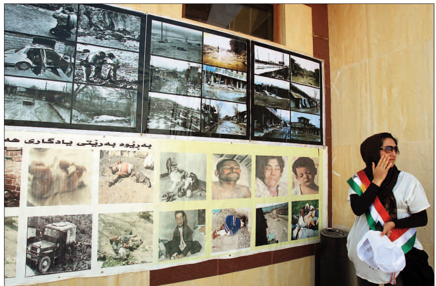
Photographs of Iraqi Kurds gassed by Iraqi President Saddam Hussein are displayed at a memorial in the Kurdish town of Halabja, in northern Iraq. By some estimates 50,000-60,000 Iranians and Kurds were killed or wounded in Iraqi gas attacks during the Iran-Iraq War in the 1980s, which led in part to the 1993 Chemical Weapons Convention.

Although chemical weapons are not as destructive as nuclear weapons,