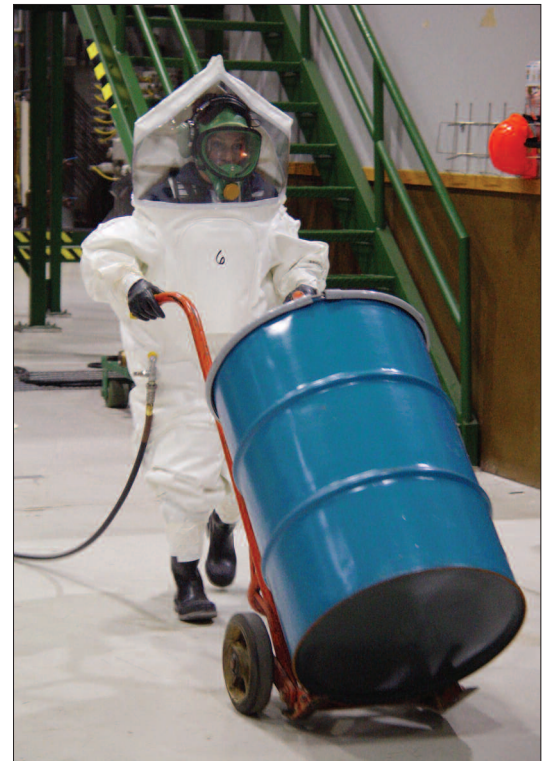
A student practices handling simulated waste at the Chemical Demilitarization Training Facility at the Army's Aberdeen Proving Ground in Maryland. Most of the world's chemical weapons have been destroyed under a 1993 treaty. However, several non-participants in the treaty, including North Korea, maintain chemical weapons stockpiles.

T he Syrian government's use of nerve gas on rebel-controlled Damascus neighborhoods this summer focused renewed attention on the threat posed by chemical and biological weapons. The attacks, which killed up to about 1,400, led President Obama to threaten military retaliation. Syrian President Bashar al-Assad responded by agreeing to destroy his chemical arsenal. Chemical weapons have been outlawed since 1928, after the world saw the horrors of their effect in World War I. After Iraq used chemical weapons to kill tens of thousands of Iranians and Iraqi Kurds in the 1980s, a 1993 international accord strengthened enforcement of the ban. The Syrian gas attacks have spurred debate over whether chemical weapons are worse than conventional arms. Meanwhile, biological weapons also are outlawed, but some experts fear they could be used by terrorists.