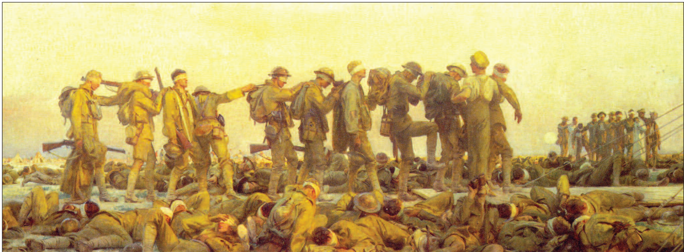
John Singer Sargent