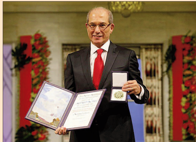
Turkish diplomat Ahmet Uzumcu, director-general of the Organisation for the Prohibition of Chemical Weapons, received the Nobel Peace Prize in Oslo, Norway, on Dec. 10, 2013.

the remaining global arsenal is in the United States and Russia, which are behind schedule in destroying their large chemical weapons stockpiles.